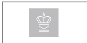
The Royal Library of Denmark