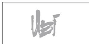
University Library of Innsbruck

Contact the Project Co-ordinator: University Library of Innsbruck, Department for Digitisation and Digital Preservation A-6020 Innsbruck - Innrain 52 - Austria, Phone: ++43-(0)512-507-8451, Fax: ++43-(0)512-507-9842, e-mail: ub-dea@uibk.ac.at