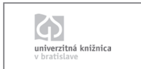
University Library of Bratislava