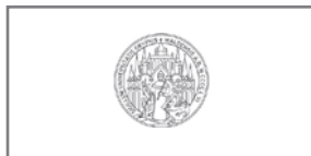
University Library of Greifswald